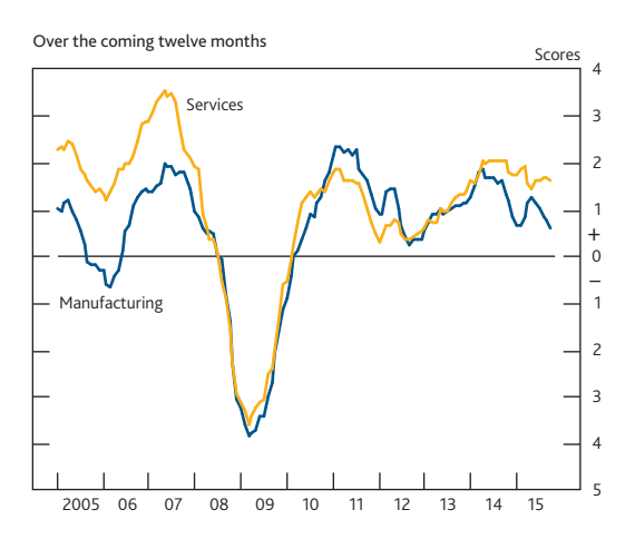
Chart 4 Investment intentions