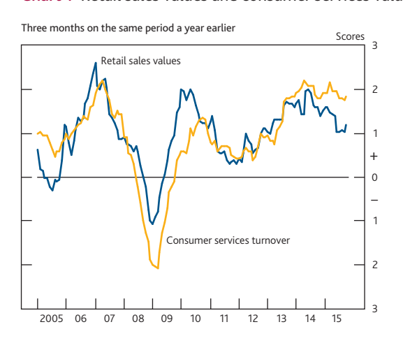
Chart 1 Retail sales values and consumer services values