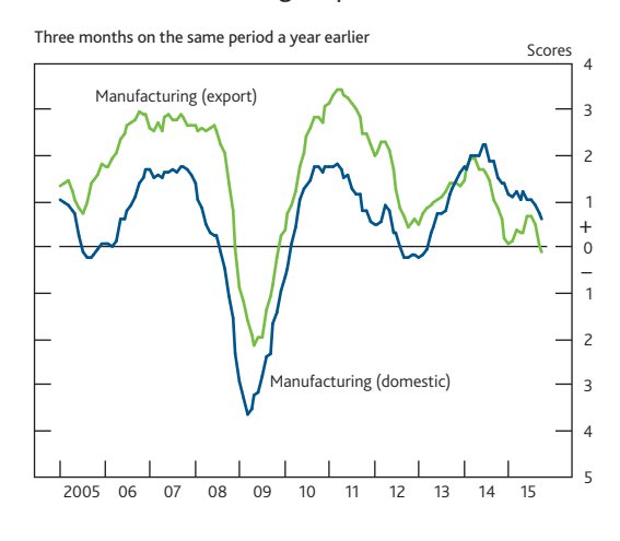
Chart 3 Manufacturing output